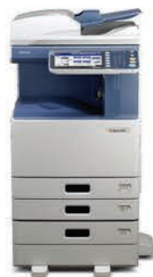
e-STUDIO3555c with Paper Feed Pedestal.