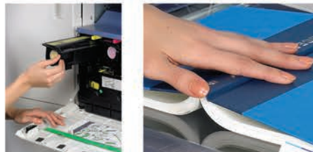
Print professional-looking, full-color newsletters and brochures using an optional saddle-stitch or staple finisher.