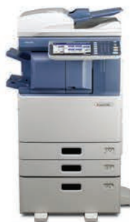
e-STUDIO3555c with Inner Finisher and LCF.