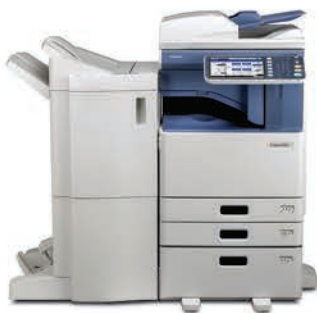
e-STUDIO3555c with Saddle-Stitch Finisher.